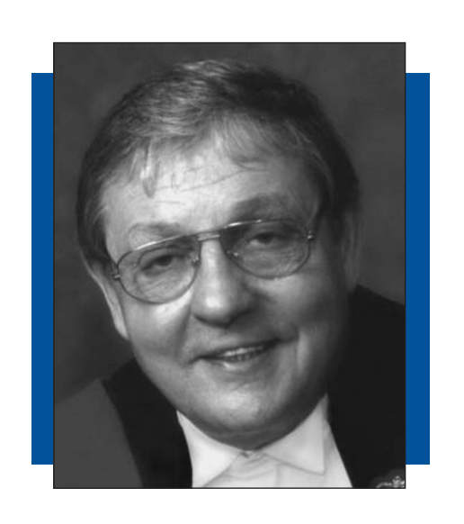
The Honourable R. Roy McMurtry chief justice of ontario